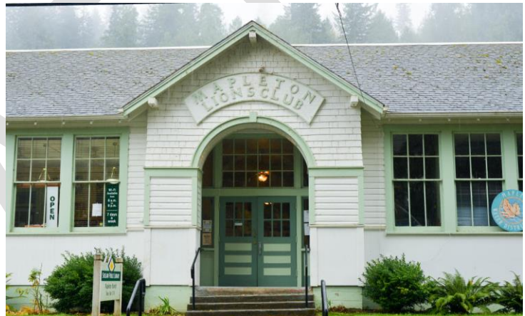
Figure 1: Mapleton School

The water system supplies service to 264 residential, commercial, and industrial customers within Lane County. The MWD's physical plant is comprised of utility infrastructure and a building on Berkshire Creek, two 300,000 gallon treated water storage tanks, and 11 miles of distribution lines.