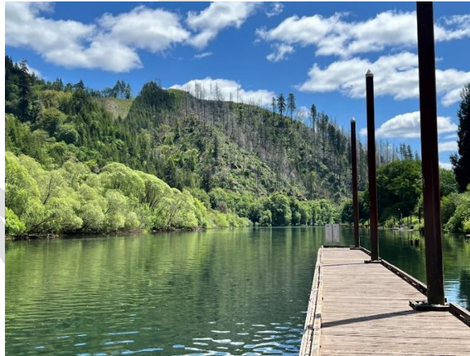
Figure 8: View of Siuslaw River (downstream) from Mapleton dock

Wildfires can occur throughout most of the planning area because of the presence of substantial vegetation. If the area was to burn, most of the MWD's infrastructure would be at risk, and the results of a significant fire would be days to weeks of interrupted service while the infrastructure was inspected and repaired. While Oregon has experienced significant wildfires over the past decade, these have not dramatically affected the planning area, in large part because of the high rainfall and lack of antecedent conditions. The 2020 Sweet Creek Fire occurred one mile south of Mapleton (see photo to the right, taken from the Mapleton Community Dock, looking towards recent fire scar). See also the wildfire hazard profile found in Volume I, Section 2.