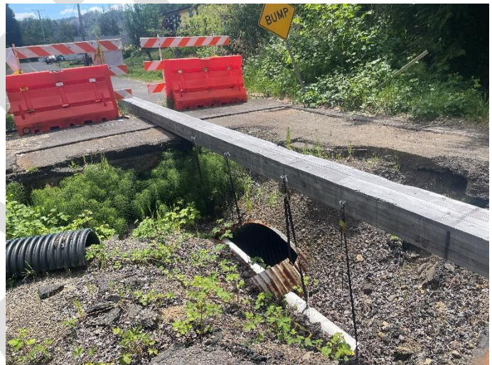
Figure 6: Sewer line repair project, River Road, Mapleton (May 2024)

Most notable is the impact of flooding on aging infrastructure. Heavy precipitation can turn rivers and creeks turbid, which presents challenges for older water treatment plans. Mapleton's aging water system infrastructure is already susceptible to pipe leaks and reduced capacity. Major flooding can cause their facilities to operate at a limited capacity or outright fail, imperiling access to healthy drinking water and water for sanitation purposes. Flooding in Mapleton is also frequently connected to increased incidence of landslides, mudslides, and downed trees, which impact the MWD's water intake and water treatment plant along Berkshire Creek. It also has severe impacts upon the community's aging sewer system (see photo to right of ongoing repairs to the sewer line adjacent to the river).