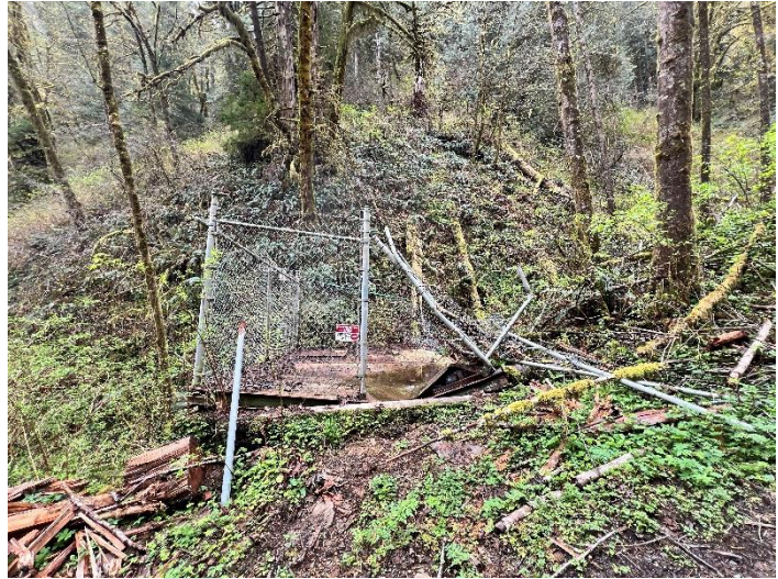
Figure 7: Damaged Raw Water Intake, Mapleton Water District (January 2024)

Winter storms can bring heavy rains in addition to snowfall in the Coast region, which can trigger flooding along the Siuslaw River, Pacific coastline, and landslides in the Coast Range, creating blockages along roadways such as Highways 126 and 36. During the January 2024 Winter Storm (DR-4768), Mapleton was temporarily cut off from communities to the north on Hwy 36 and from Eugene to the east on Highway 126 due to downed trees. The ice accumulation caused extensive damage to the tree canopy, bringing several trees down along the easement leading to the MWD's raw water intake (see photo to right of January 2024 winter storm damage at the intake).