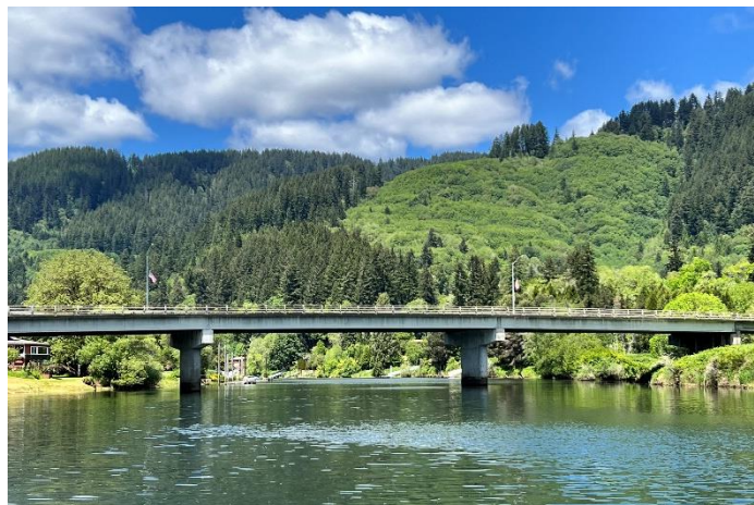
Figure 5: Siuslaw River Bridge, Mapleton

The Siuslaw River has seen frequent flood events. The commercial core of Mapleton and the houses along the river are within its 100-year floodplain and floodway. Between 1861-2012, five (5) major flood stage events have occurred in Mapleton, flooding the Riverview Avenue area and numerous homes and businesses, as well as significant flooding on roads adjacent to the Siuslaw River (including Highways 126 and 36). In that same time span, there were an additional 12 moderate floods in the Mapleton area, many of which were riverine floods exacerbated during high tide.