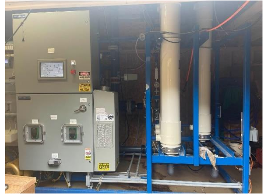
Figure 3: Replacement Water Treatment skid, May 2024

treatment plant, scheduled for completion in 2024-2025. This work includes expansion to the existing building, a new drinking water treatment skid and new pre-filtration equipment. With the assistance of an USDA Emergency Community Water Assistance Grant , MWD will also replace approximately one-half mile of piping that brings raw water into the plant from the Berkshire Creek intake. The raw water line runs along an easement granted to the MWD from the United States Forest Service, who owns the Berkshire Creek watershed. Additionally, the ECWAG funds will provide upgrades to the intake access road and mitigation to the plant and intake infrastructure.