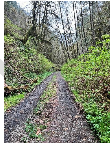
Figure 4: Easement leading to Raw Water Intake

The existing distribution system, installed in the early 1950s, uses concrete asbestos pipes that had a life expectancy of 50 to 70 years. The pipes are roughly 5 to 25 years past this expectancy and require frequent patching to maintain system integrity. MWD estimates that approximately 67% of the utility's produced drinking water is lost annually through leaks. Current estimates for system-wide pipe replacement are around $15 million.